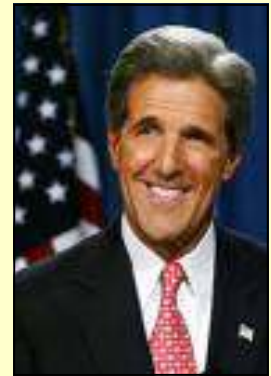
Senator John Kerry Democrat/Massachusetts