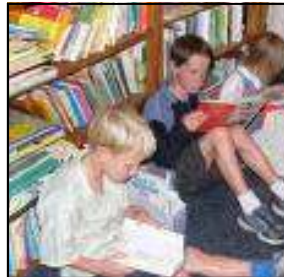
A Mason Classroom