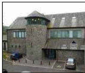
The Charlotte Mason Library